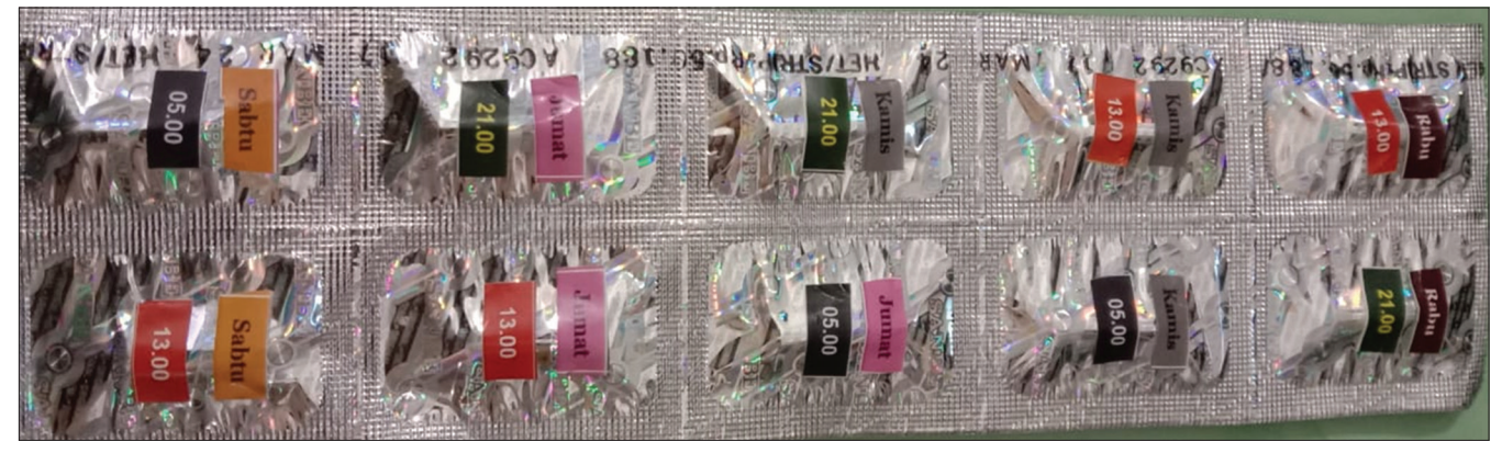
Figure 1: Stickers application on antibiotics package

Baseline characteristic data such as the age, gender, educational background, and the average of drugs consumed were compared between two groups to confirm that there were no differences in