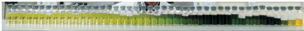
Fig. 1. Fractions in vial

After going through the multistage maceration utilizing n-hexane followed by methanol, from 150 gram of dry leaf powder, the extraction process yields 5.12 g methanol extract or equal as 3.14 with green-yellowish colour. Following six hours running in the column, 100 vials of different extract (Figure 1) were collected based on the similarity of its colour. Then, they were classified into 10 common fractions, which were identified by the RF value and colour of the TLC's spot colour under UV lamp with the wavelength of 366 nm, as shown in Figure 2.