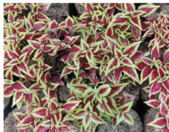
Figure 1. Miana ( Coleus blumei ) plants

Miana plant samples (Figure 1) were obtained from the Juanda area of Sidoarjo, East Java. Then the plant was identified at the Biology Service Unit of Airlangga University in Surabaya to ensure that the plant was a Miana plant ( Coleus blumei ).